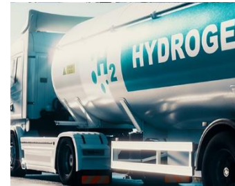
GH 2 trailer filling