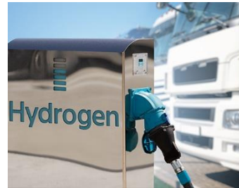
H 2 fuel station