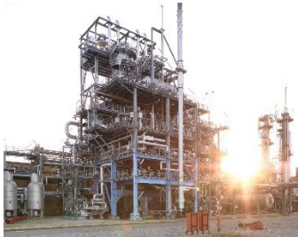
H 2 for industry, synfuels, ammonia