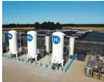
H 2 liquefaction LH 2