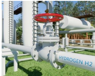
H 2 & NG pipelines