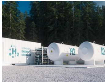
H 2 storage